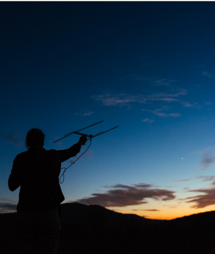
Endangered Species Tracking and Monitoring.