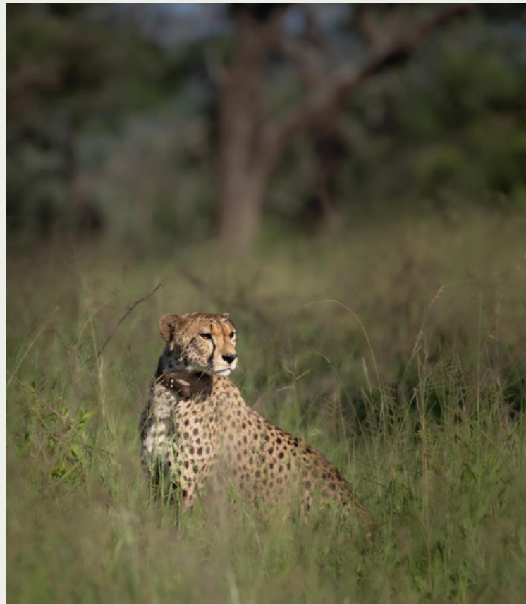
Saving Endangered Species