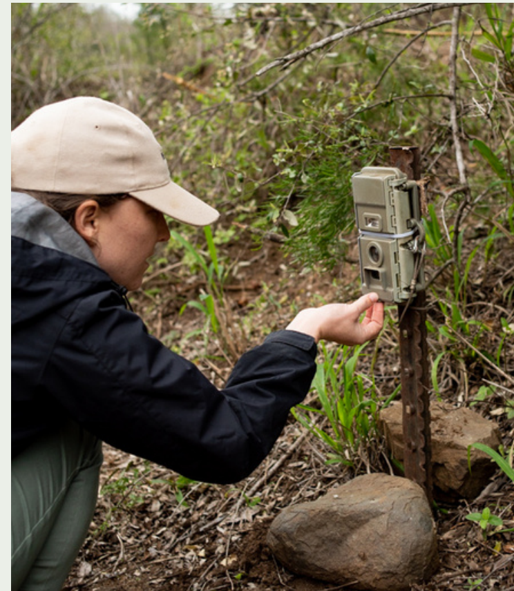
Monitoring and Tracking Technology